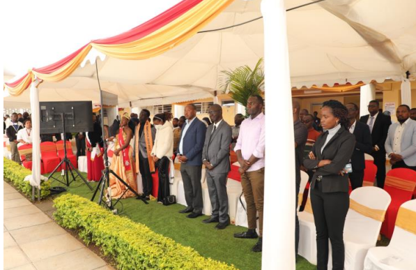
CELEBRATING A NEW DAWN OF GREATER SERVICE TO CHURCH AND SOCIETY