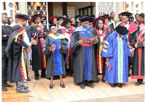
CELEBRATING A NEW DAWN OF GREATER SERVICE TO CHURCH AND SOCIETY